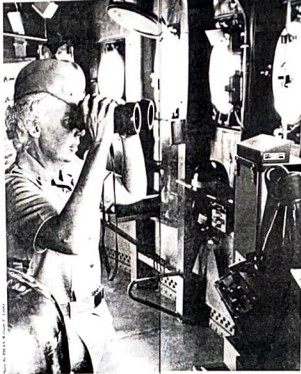
ALL HANDS DECEMBER 1983