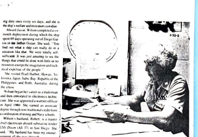
ALL HANDS DECEMBER 1983