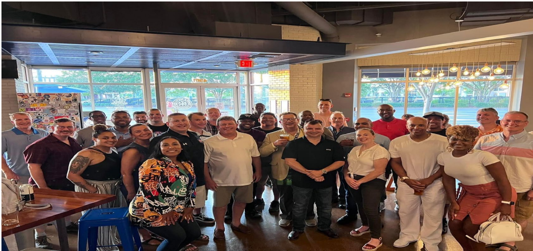
Mustang Social with the Hampton Roads Mustangs